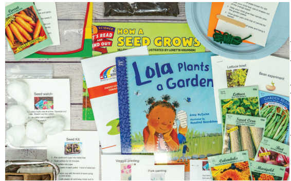
Pictured: May Seed-themed Kindercarton

KINDER CARTONS: Complete preschool curriculum (math, language, and science), theme-based books, craft kits, word cards and more! https://getready4kindergarten-shop.com